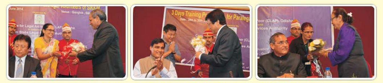
Training programme for PLVs by CLAP in collaboration with Sikkim SLSA