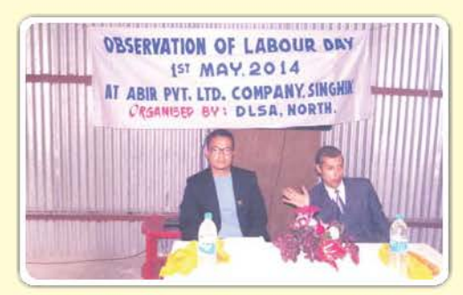
Abir Put. Ltd. Co., Singhik, Mangan, North Sikkim