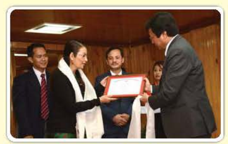
Chairperson, DLSA (East)

The Chairpersons and Secretaries of District Legal Services Authorities/Ex-Officio Chairpersons of Taluk Legal Services Committees were presented with Certificates of Appreciation by Hon'ble Executive Chairman, Sikkim SLSA for their commendable work in holding legal awareness camps in the most inaccessible and remote locations of the State. They were also lauded for effectively implementing the scheme of Sikkim SLSA and NALSA.