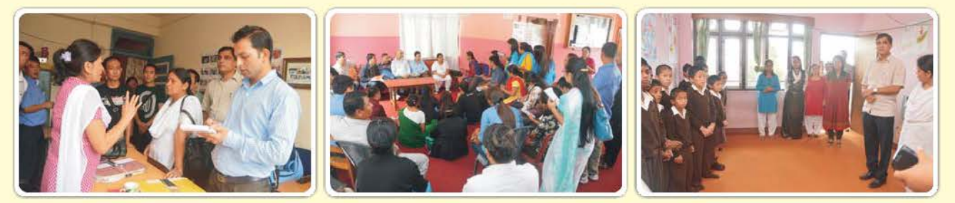
Exposure visit of PLVs to different Institutions