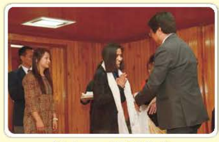
Chairperson, DLSA (West)