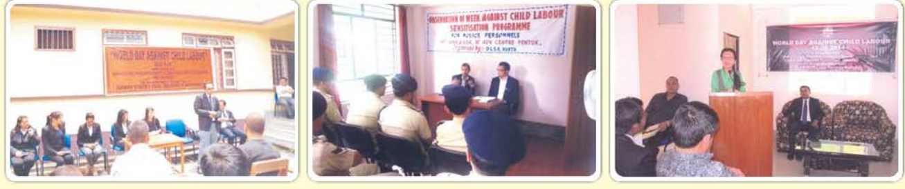
District Court premises, Gyalshing, West Sikkim