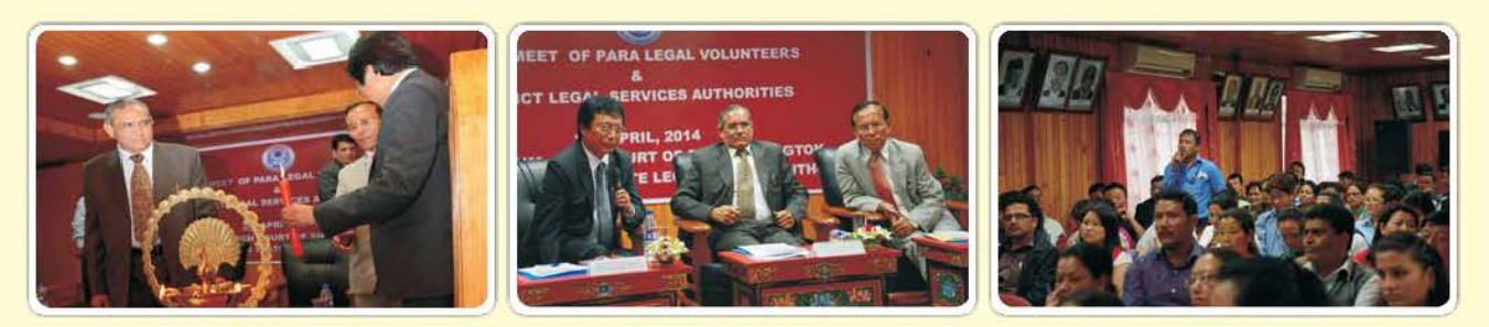
State Meet of Para-Legal Volunteer and District Legal Services Authorities